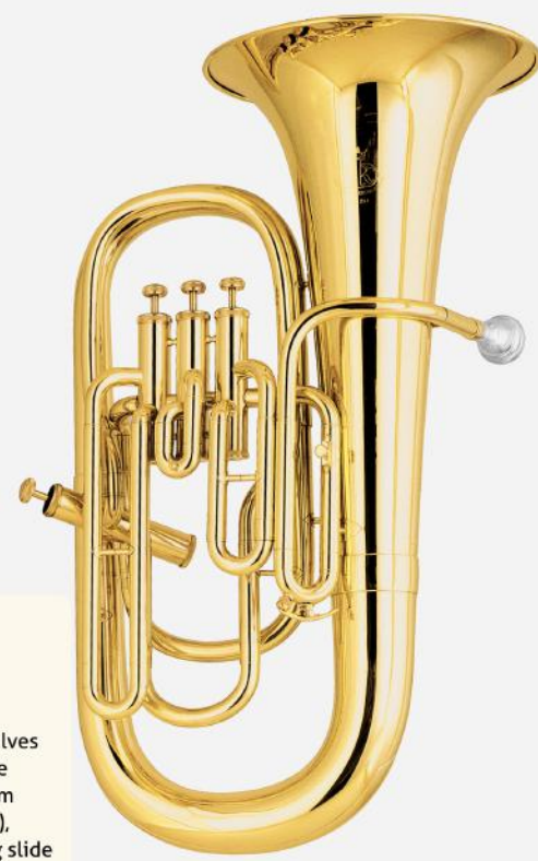
Standard AEP 241E AMATI Bb Euphonium Standard model Upright construction, 4 valves (3 top action valves, 1 side action valve), bore 13.2mm (.520"), bell 250mm (9.8"), yellow brass finish, tuning slide waterkey, lacquer. AEP 241ES - silverplated.