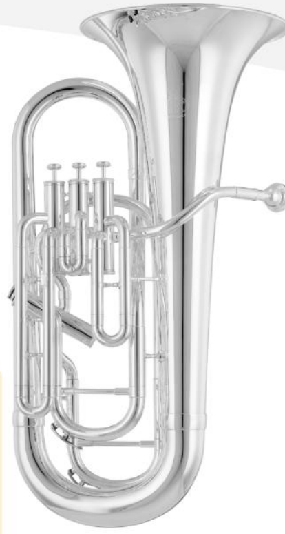
Intermediate AEP 345S AMATI Bb Euphonium Intermediate model Upright construction, 4 valves (3 top action valves, 1 side action valve), dual bore 14.5mm-15.2mm (.570"-.598"), bell 300mm (11.8"), yellow brass finish, 2 waterkeys, silverplated. AEP 345 - lacquered.