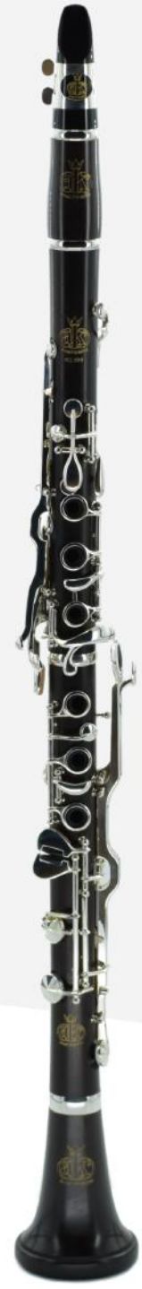
Professional ACL 656 AMATI G Clarinet German system 17 keys, 6 rings, bore 14.6mm (.575"), all Grenadilla wood, 3 Trill keys, Eb lever, 2 barrels, adjustable thumb rest with ring for neck strap, leather pads, silver-plated keywork.