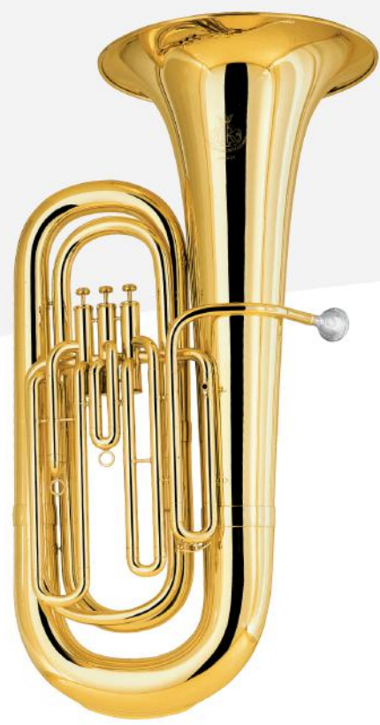
Standard ABB 221 AMATI BBb Tuba Standard model 3 piston valves, 4/4 size, yellow brass finish, bore 6.2mm (.640"), bell 400mm (15.75"), height 930mm (36.6"), nickel- silver outer slides, tuning slide waterkey, lacquer. ABB 221S - silverplated. ABB 221C - with convertible marching mouthpipe.