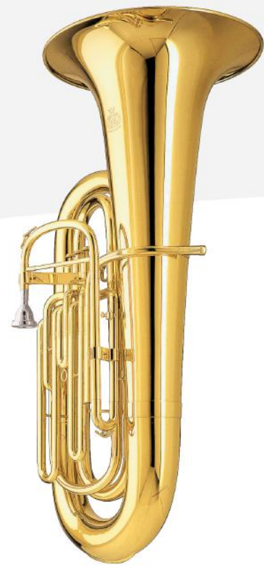
Intermediate ABB 321 AMATI BBb Tuba Intermediate model 4 inline piston valves, 4/4 size, yellow brass finish, bore 16.2mm (.640"), bell 400mm (15.75"), height 930mm (36.6"), tuning slide waterkey, lacquer. ABB 321S - silverplated.