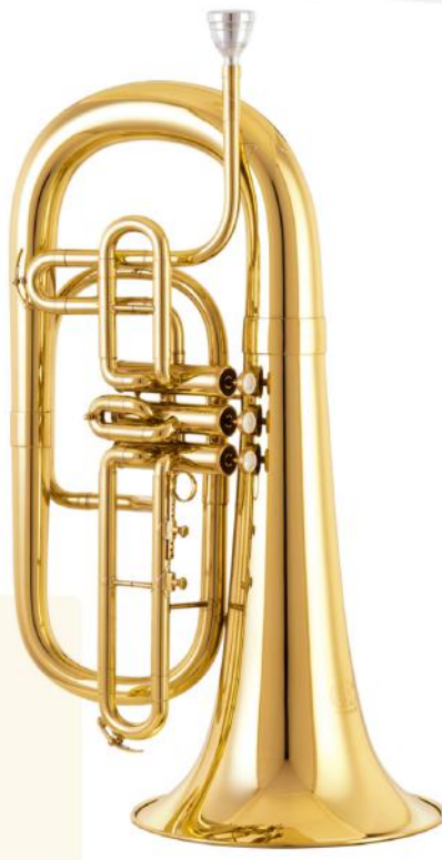
Standard AEP 235E AMATI Bb Euphonium Standard model Marching construction, 3 top action valves, bore 13.2mm (.520"), bell 250mm (9.8"), yellow brass finish, 2 waterkeys, lacquer. AEP 235ES - silverplated.