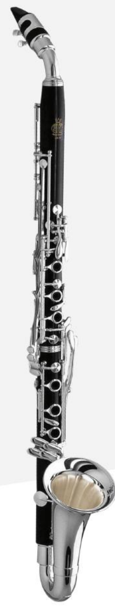
Intermediate ACL 681 AMATI Eb Alto Clarinet with ring keys Boehm system intermediate model 22 keys, 6 rings Bore 17mm (.670") All Grenadilla wood, adjustable thumb rest, silver-plated keywork.