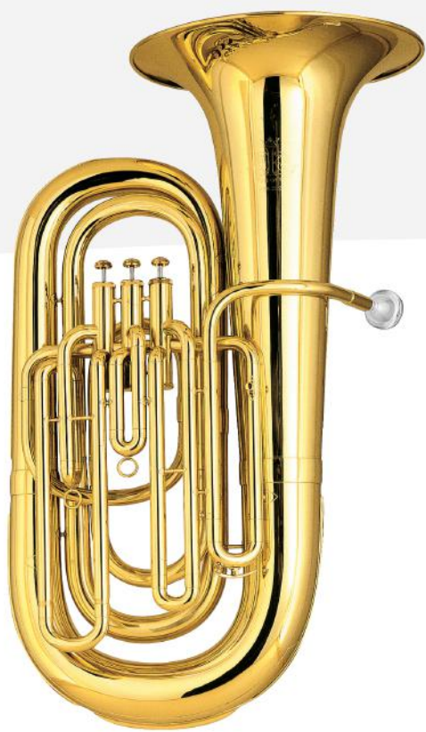
Standard ABB 223C AMATI BBb Tuba Standard model 3 piston valves, 1/4 size compact "BABY" model, yellow brass finish, bore 16.2mm (.640"), bell 350mm (13.8"), height 790mm (31.1"), nickel-silver outer slides, tuning slide waterkey, lacquer. ABB 223S - silverplated. ABB 223C - with convertible marching mouthpipe.