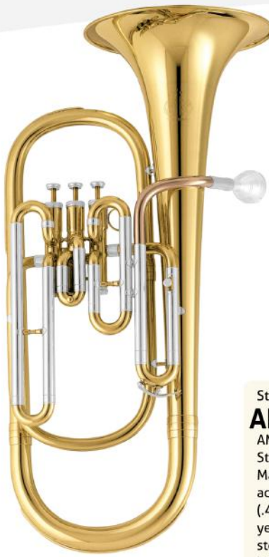
Standard ABH 321 AMATI Bb Baritone Horn Standard model Upright construction, 3 top action valves, bore 12.4mm (.490"), bell 220mm (8.7"), yellow brass finish, stainless steel valves, red brass mouthpipe, nickel-silver trimmings, compact Valve Group design, tuning slide waterkey, lacquer. ABH 321S - silverplated.