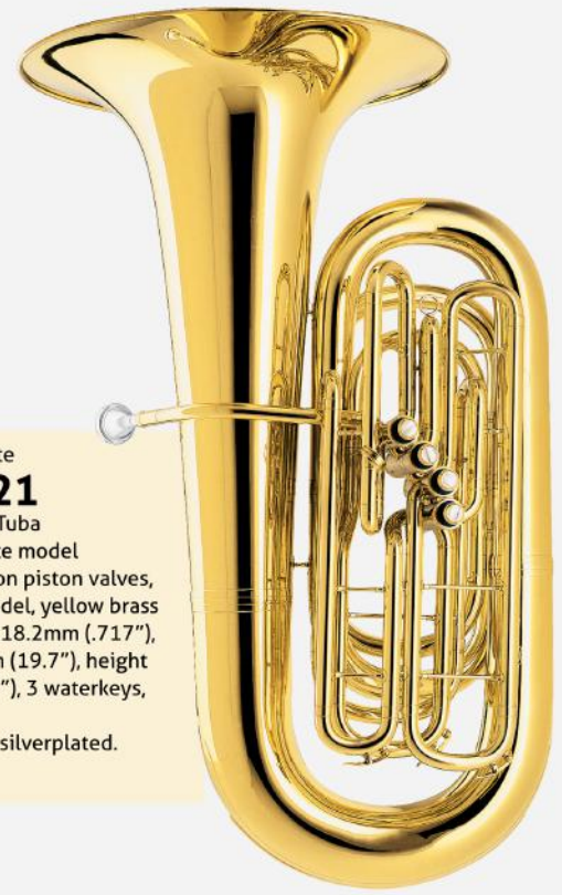
Intermediate ABB 621 AMATI BBb Tuba Intermediate model 4 front action piston valves, 4/4 size model, yellow brass finish, bore 18.2mm (.717"), bell 500mm (19.7"), height 940mm (37"), 3 waterkeys, lacquer. ABB 621S - silverplated.