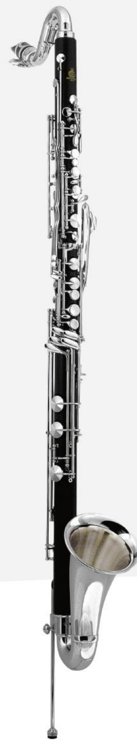
Professional ACL 691 AMATI Bb Bass Clarinet Boehm system professional model range to low Eb (short model), 37 keys, all Grenadilla wood, bore 23mm (.905"), semi-automatic octave key, silver-plated keywork.