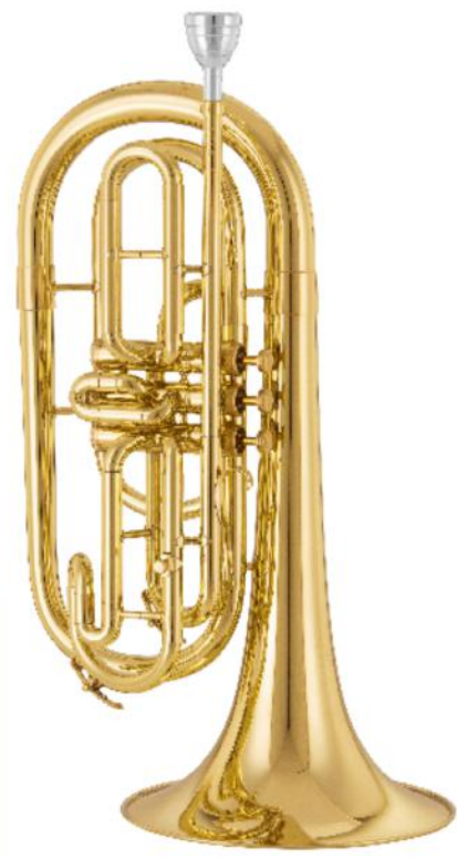
Standard ABH 225 AMATI Bb Baritone Horn Standard model Marching construction, 3 top action valves, bore 12.4mm (.490"), bell 230mm (9"), yellow brass finish, stainless steel valves, 2 waterkeys, lacquer. ABH 225S - silverplated.