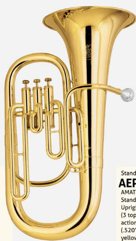
Standard AEP 231E AMATI Bb Euphonium Standard model Upright construction, 3 top action valves, bore 13.2mm (.520"), bell 250mm (9.8"), yellow brass finish, tuning slide waterkey, lacquer. AEP 231EC with convertible marching mouthpipe. AEP 231S - silverplated.