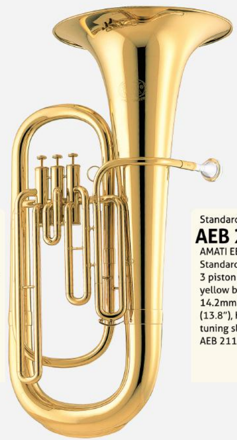
Standard AEB 211 AMATI EEb Tuba Standard model 3 piston valves, 4/4 size, yellow brass finish, bore 14.2mm (.560"), bell 350mm (13.8"), height 790mm (31.1"), tuning slide waterkey, lacquer. AEB 211S - silverplated.