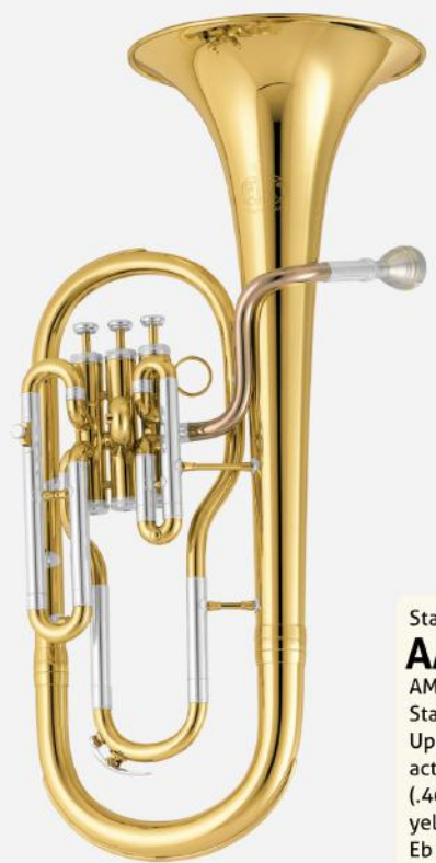
Standard AAH 311 AMATI Eb Alto Horn Standard model Upright construction, 3 top action valves, bore 11.7mm (.460"), bell 200mm (7.9"), yellow brass finish, stainless steel valves, red brass mouthpipe, nickel-silver trimmings, compact Valve Group design, tuning slide waterkey, lacquer. AAH 311S - silverplated.