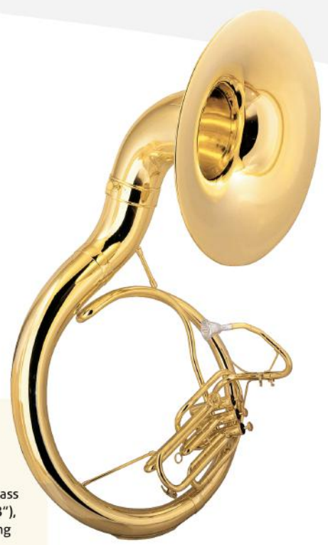
Standard ASH 254II AMATI EEb Sousaphone, Standard model 3 piston valves, yellow brass finish, bore 16.2mm (.638"), bell 600mm (23.6"), tuning slide waterkey, lacquer. ASH 254IIS - silverplated.