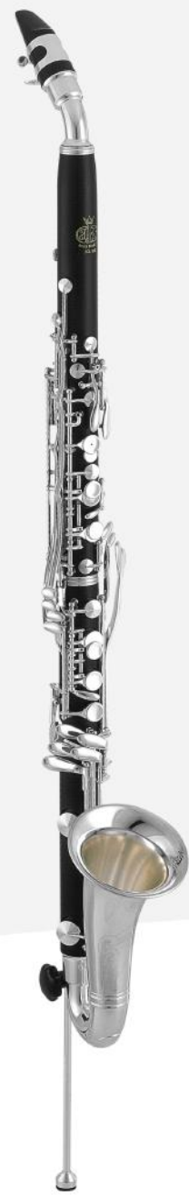
Intermediate ACL 682 AMATI Eb Alto Clarinet with closed holes (Plateau style) Boehm system intermediate model 23 keys, 7 covered keys Bore 17mm (.670") All Grenadilla wood, low Eb key, adjustable thumb rest, silver-plated keywork.