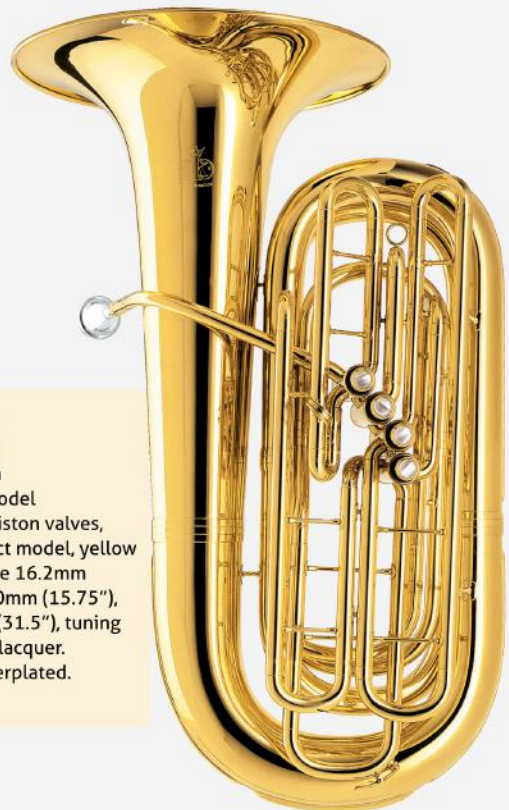
Intermediate ABB 323 AMATI BBb Tuba Intermediate model 4 front action piston valves, 1/4 size compact model, yellow brass finish, bore 16.2mm (.640"), bell 400mm (15.75"), height 800mm (31.5"), tuning slide waterkey, lacquer. ABB 323S - silverplated.