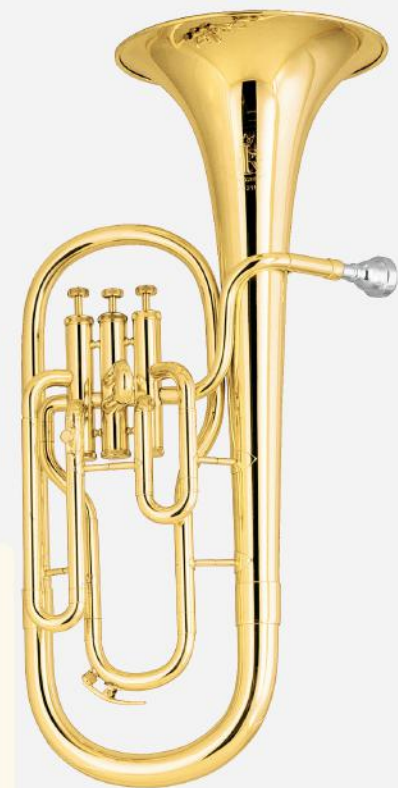
Standard AAH 212A AMATI F Alto Horn Standard model Upright construction, 3 top action valves, bore 11.7mm (.460"), bell 190mm (7.5"), yellow brass finish, with extra Eb slide, tuning slide waterkey, lacquer. AAH 212AS - silverplated.