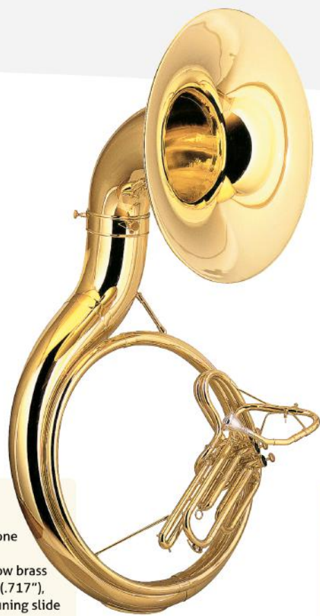
Standard ASH 260II AMATI BBb Sousaphone Standard model 3 piston valves, yellow brass finish, bore 18.2mm (.717"), bell 610mm (24"), tuning slide waterkey, lacquer. ASH 260IIS - silverplated.