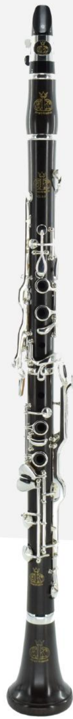
Professional ACL 640 AMATI G Clarinet German system 17 keys, 4 rings, bore 14.6mm (.575"), all Grenadilla wood, 3 Trill keys, Eb lever, 2 barrels, adjustable thumb rest with ring for neck strap, leather pads, silver-plated keywork.